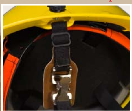
New standardized "molded slot fitting" chinstrap attachment point.