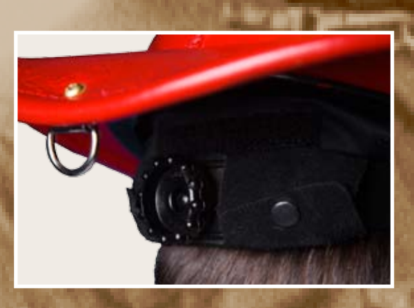
Shown with Ratchet System

Phenix Technology offers several options when building your custom TL2. Choose from suspension, shroud and chinstrap options, as well as leather ID shield choices. You can install a front flip down style eye shield, however this is strictly an accessory piece.