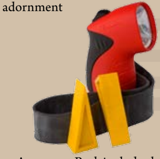
Accessory Pack includes helmet band, Garrity Lite, and Door Wedges.