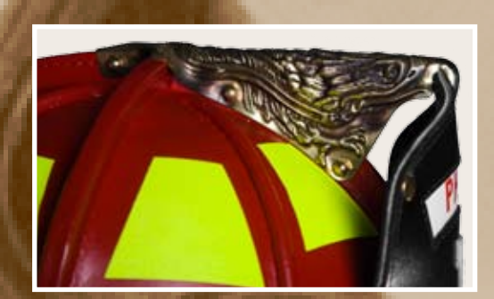
Traditional Brass Eagle Finial