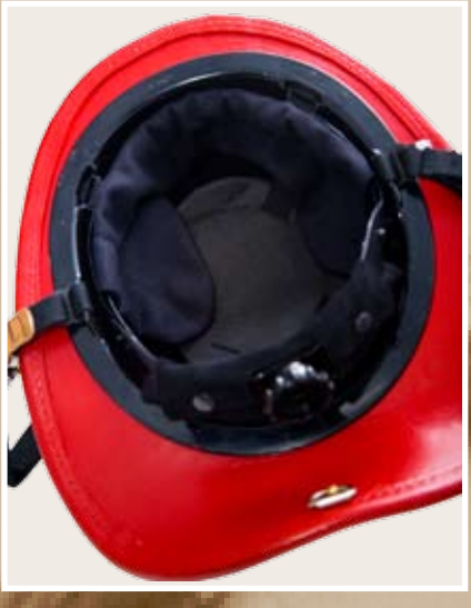
Shown with inserted Comfort Padding

Your standard TL2 model with all of the above components meets or exceeds current NFPA criteria.