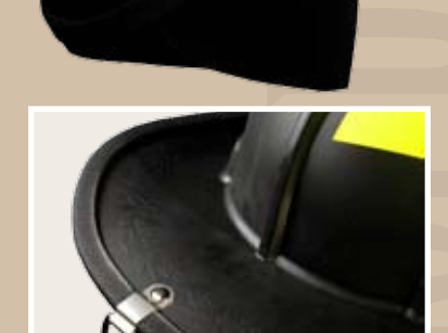
In honor of our heros, our filigree includes a 9/11 commemoration