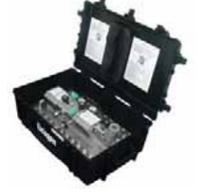
DOB-H: Small, light, efficient. (L 625 x W 420 x H 270 mm)

OUR MOBILE PUMPS ARE COMPACT AND ROBUST, BUT OFFER THE SAME HIGH LEVELS OF PERFORMANCE AND USER-FRIENDLINESS AS THE FIXED STATIONS. DESIGNED WITH COMPACT DIMENSIONS AND REDUCED WEIGHT, THEY CAN BE TRANSPORTED EASILY TO ANY SITE - OFFERING THE ULTIMATE IN MOBILITY.