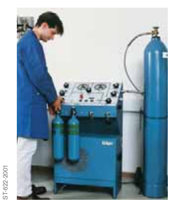
Dräger Oxygen Booster DOB 200: Filling process

NOW YOU CAN BREATHE MORE EASILY: JUST A FEW YEARS AGO, ENSURING A RELIABLE SUPPLY OF OXYGEN CYLINDERS WAS A LOGISTICALLY COMPLICATED AND COSTLY BUSINESS, BUT TODAY IT IS NO PROBLEM AT ALL - AND MUCH CHEAPER - TO HAVE BREATHING GAS AT THE READY FOR ANY OPERATION. WHEN WE DEVELOPED OUR NEW GENERATION OF BOOSTER PUMPS, RELIABILITY AND USER-FRIENDLINESS WERE OUR OVERRIDING PRIORITIES.