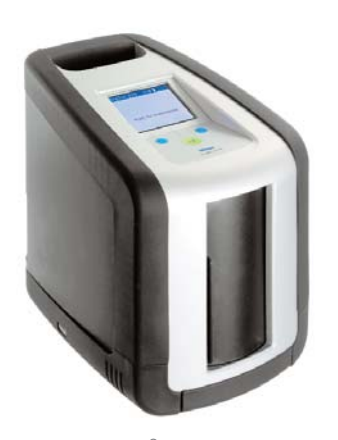
Dräger DrugTest® 5000 Analyzer

Combined with a carry bag, this mobile system is a complete "substance abuse monitoring" system for on-the-spot measurements when equipped with a Dräger DrugTest® 5000 Analyzer, Dräger Mobile Printer, keyboard, DrugTest® 5000 Test Kits, breath alcohol testing device, mouthpieces, and system documentation.