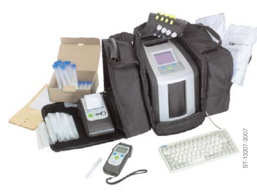
Carrying Bag with Complete System